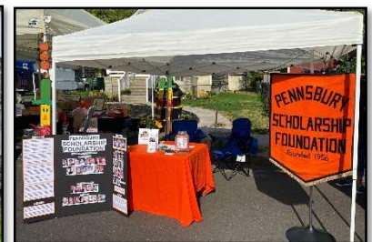
The PSF booth at Yardley Harvest Day and Historic Fallsington Day.

Do you have time and talents to share? Consider becoming a PSF board member! Email scholarships@pennsbury.org for details